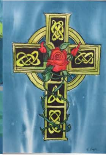
Public is Invited to Artists' Reception Thursday, September 26, 4:30-6:30 p.m.