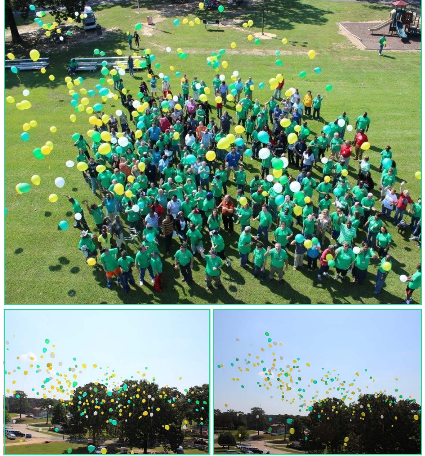
Boswell Regional Center Celebrated its 40th anniversary with a balloon release. The balloons were the original BRC colors when it was established in 1976. Page 3