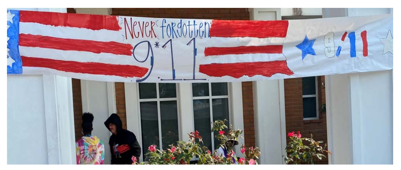
More poignant signs reminded everyone that Sept. 11, 2001, is a day no one should ever forget.