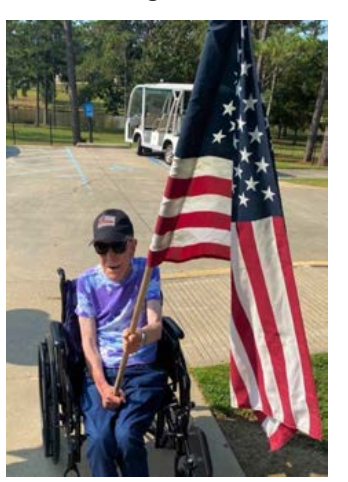
Pausing for a prayer and moment of silence and releasing balloons was something campus individuals felt honored to do on a somber day of mourning for our country.