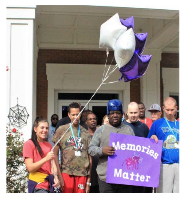
Ridgeview's guys were ready to roll when it came time for them to walk.