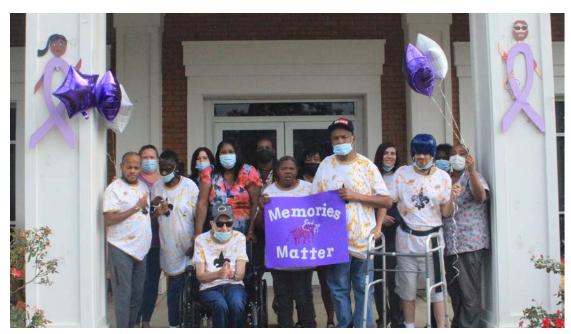
The ladies and men of Pinelake were excited to get out and walk in honor of Alzheimer's Month. Several staff members sponsored this team for walking. Individuals with mobility problems were not left out of the fun; staff escorted them and made sure they could join in the walk with their friends.

Individuals from each unit walked separately along with staff to specific points around campus. Staff sponsored individuals and made donations in honor or memory of family members with the disease.