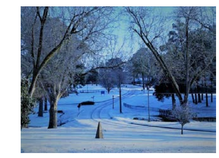
Looking like a scene from a Hallmark movie, Boswell's icy roads and slippery rolling hills were easier to photograph than maneuver.

Left, it's easy to imagine the Preventorium children sliding down the hill during the ice storm of 1963 and other rare Mississippi snowfalls.