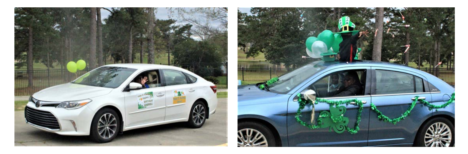
A festive St. Paddy's Day Parade was enjoyed by campus individuals. Staff, departments and family members decorated vehicles in green and waved to those gathered outside the buildings while throwing candy and beads.

While it was a scaled-down version of larger parades we've had in the past year, individuals enjoyed standing outside and watching the cars, trucks and other vehicles filled with family members and staff wave and throw candy and beads from decorated cars in the St. Paddy's Day parade.