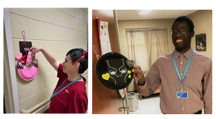
The ladies and guys on the campus units made Valentine's card holder in their art class, then were excited to find cards placed inside on the 14th.