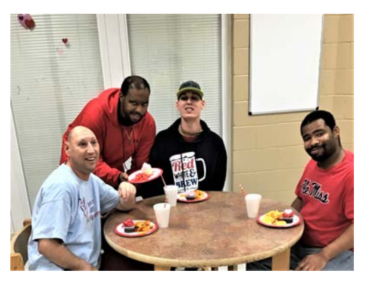
Special Valentine's Day parties were held on each unit, complete with punch and refreshments.