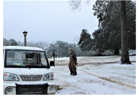
Chain saws could be heard buzzing all over campus as grounds crew members cut large trees and limbs that fell all over campus.