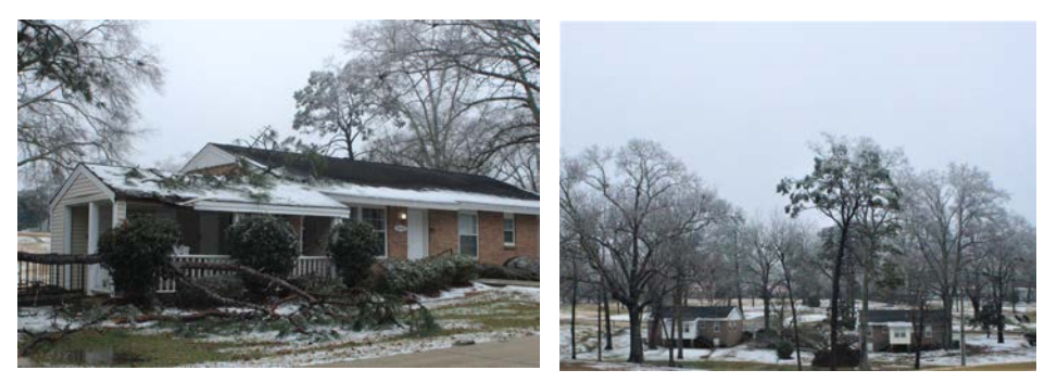
A mammoth tree fell on one of the staff offices during the ice storm. Luckily, the damage was minor and Boswell's grounds crew was able to remove the tree and limbs in the following days.