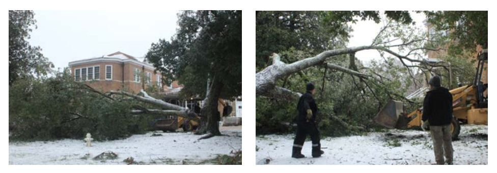
Another old tree fell outside Nutrition Services. The grounds crew used heavy equipment and chain saws to remove it in a few short hours.