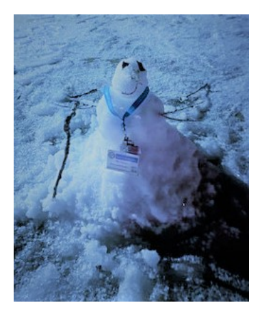
While most staff huddled inside warm buildings with individuals, a few brave ones ventured outside to build a snowman made mostly from frozen sleet and ice.

See page 9 for a list of staff who went "beyond the call" during the ice storm.