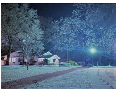
A beautiful sight awaited those who were able to drive in to campus for the evening shift. Many ended up staying overnight to avoid getting stuck at home due to hazardous road conditions.