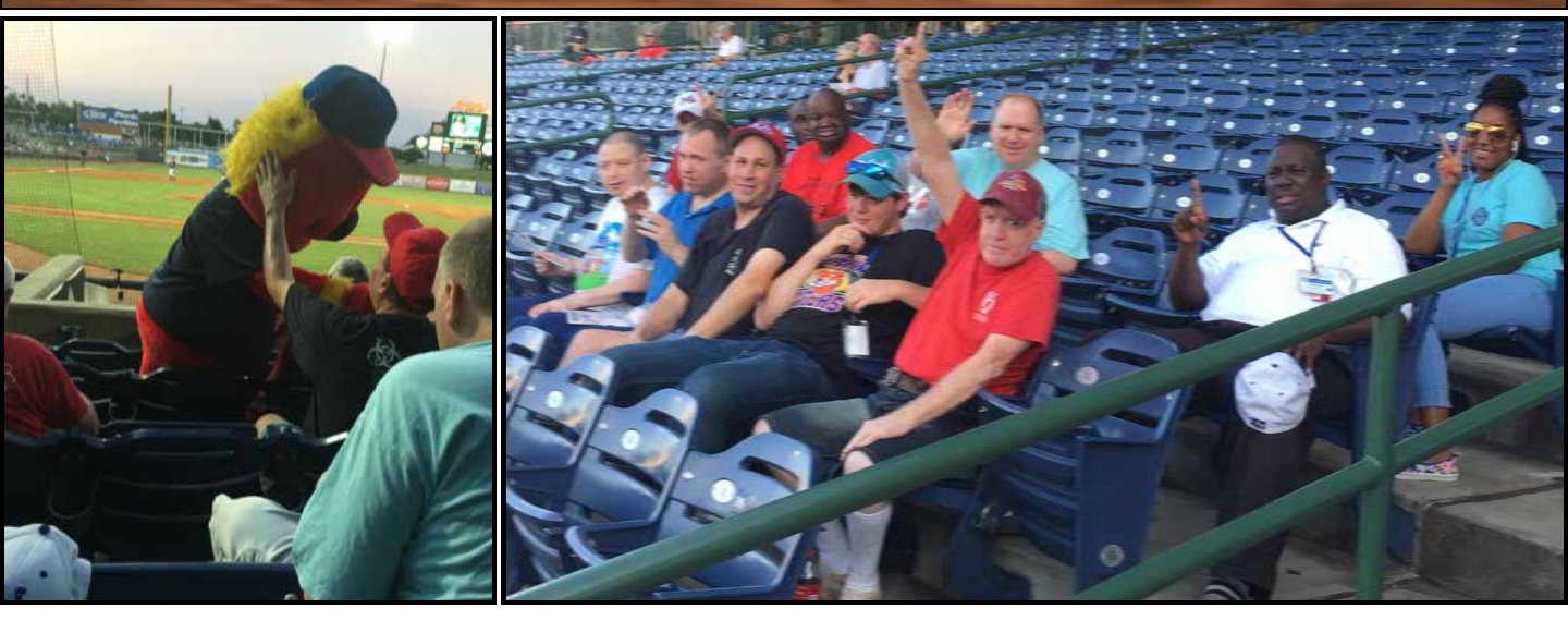
Everyone enjoyed and evening of baseball at Trustmark Park in Pearl, MS.