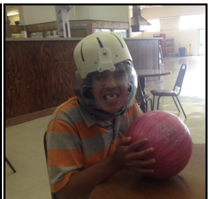
MAC clients enjoyed a bowling trip to McComb during July. As you can tell by the pictures – the clients had a great time, and they enjoyed themselves.