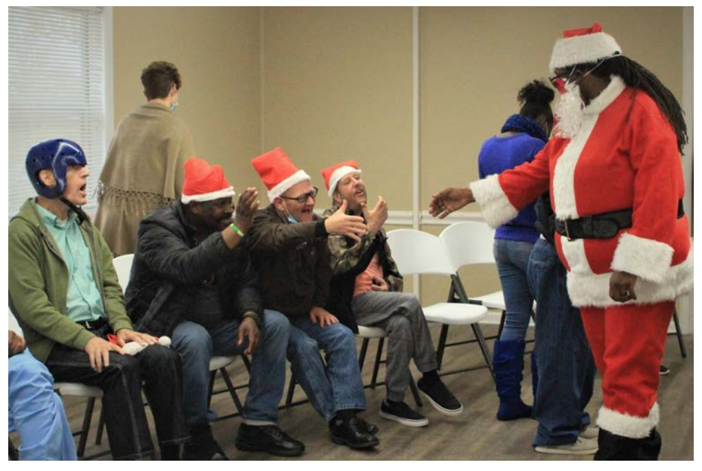
Santa also made an appearance at Fairway's party, much to the delight of the guys.