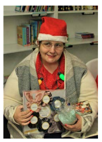
Hair care items delighted this lady that resides at Oakbrook.