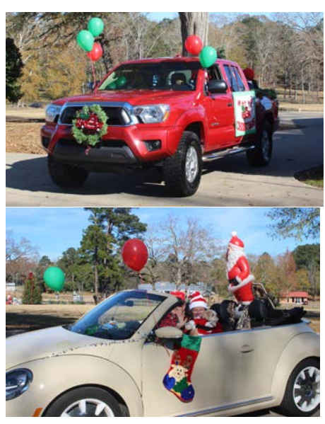
Family members decorated their vehicles and drove through campus to wave to their loved ones.