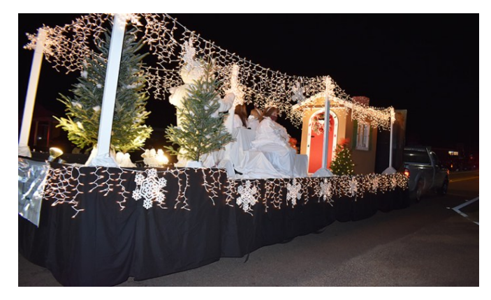
Boswell's Christmas float won top prizes in area Christmas parades. The float was created by Maintenance, Rhonda McCallum and Community staff.