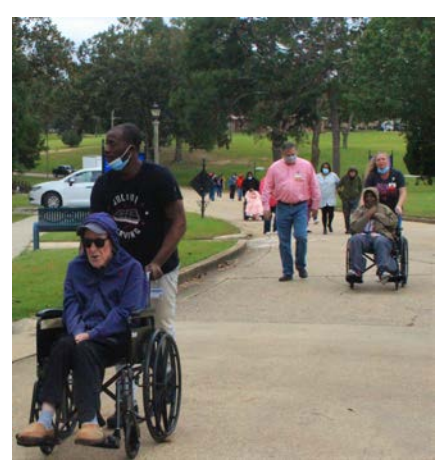
Despite their status as our elder individuals, the ladies and men of Pinelake, above, are always willing to get out and walk in honor of a good cause. It was a chilly day, but those that wanted to participate were bundled up and kept warm. Staff escorted those with mobility issues and made sure they walked or rode safely.