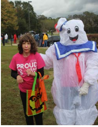
Trick-or-treating was enjoyed by individuals at Oakbrook and Ridgeview, complete with staff dressed as favorite characters.