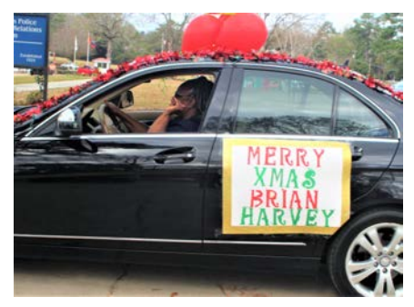
Family members decorated their vehicles and drove through campus to wave to their loved ones.

Reviving a popular event of the past, a Christmas parade through campus was held the week prior to Christmas. Staff, family members and City of Magee, including the Mayor, police and fire departments, participated this year to the delight of individuals.