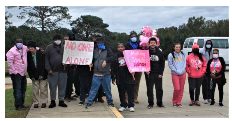
The guys at Fairway weren't that excited about wearing pink, but walking was a different story. They enjoyed getting a little exercise and participating in an event to raise money to help others.