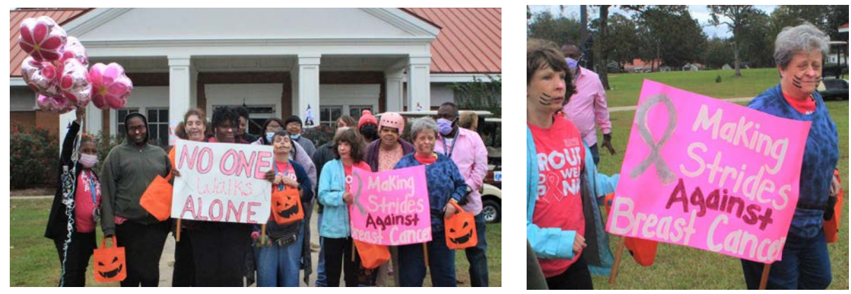
The ladies of Oakbrook, above, were excited to don their pink shirts (along with Halloween décor in preparation for that afternoon's party) and walk to raise money during Breast Cancer Awareness Month.

The remaining months of 2021 were a busy time at Boswell for both our individuals and staff. "Pink October" Breast Cancer Fund-Raising and Awareness Walk, Fall carnival and Halloween parties were just a few of the fun activities our individuals enjoyed. Here is a "snapshot" of the many ways we closed the year out with a bang!