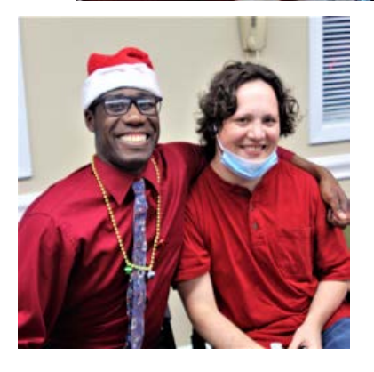
Left, above and right, Ridgeview's guys looked sharp at their party, dressing up in their "Sunday" shirts and ties. They enjoyed socializing with staff members, dancing to music and eating party foods.