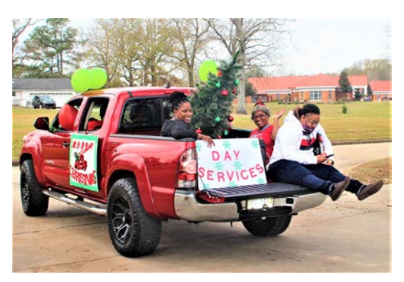
Day Services' staff enjoyed decorating a truck and riding in the parade together.