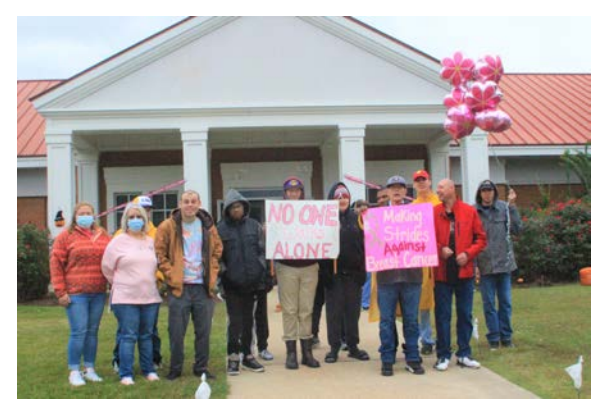
A brisk walk over to Green Park was the perfect outing for the energetic guys at Ridgeview, who are always good sports, willing to help for a good cause.