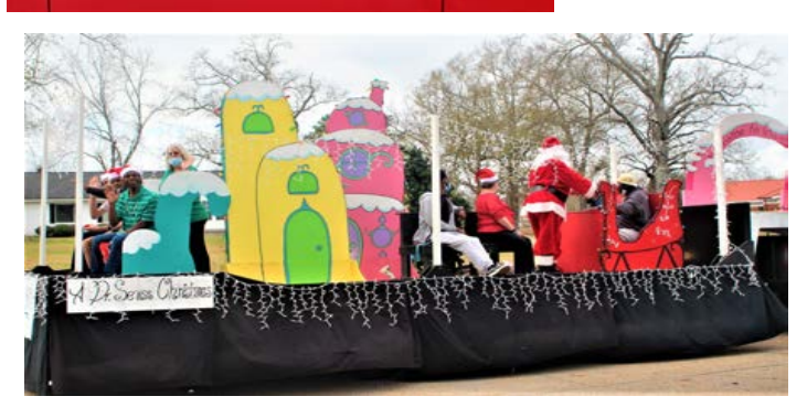
Boswell's Christmas was created by Maintenance and Community staff. Santa rode on the float and called out to individuals by name.