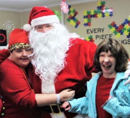
Dancing with Santa, above, and getting a hug, left, was the highlight of the night for these ladies at Oakbrook's party.