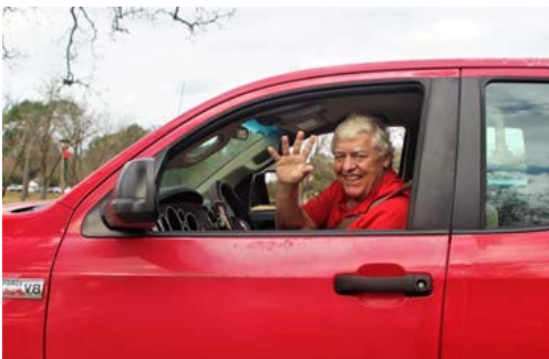
The City of Magee is always supportive of Boswell. Two police cars, a fire truck and Mayor Dale Berry, left, participated in the Christmas parade, something they've done since 2020.