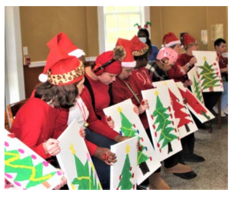
Individuals attending Day Services classes made Christmas ornaments in class and proudly showed off their work at a party, above left, while those attending art classes, left. presented their work while singing Christmas carols for staff.