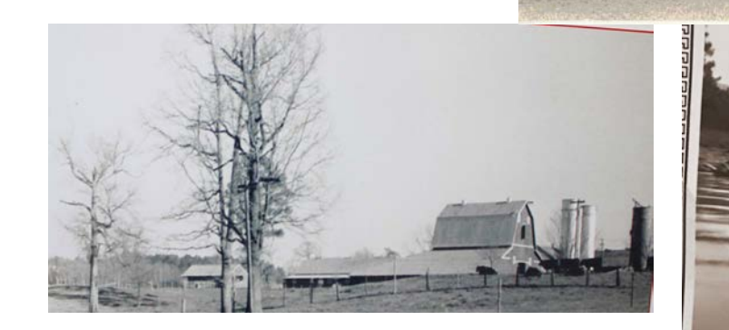
An aerial shot (above) from the previous century shows a modern hospital and buildings. The farm (below) provided food and milk for patients and staff.