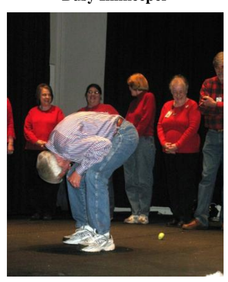
How many eggs?