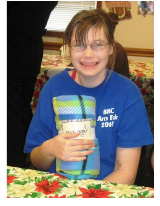
An individual from Unit 2 is pictured showing her present from Westminister.