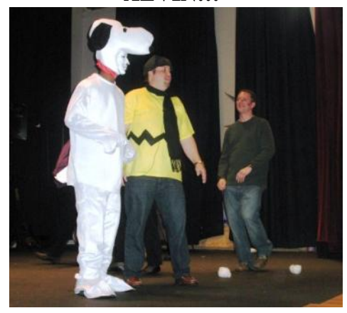
Good Grief...Charlie Brown!