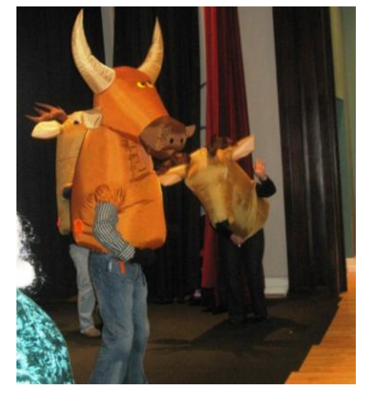
No bull...reindeer win!