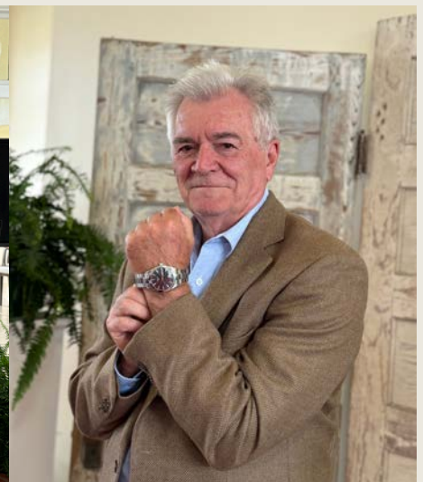
A special gift for all the time you've given us.