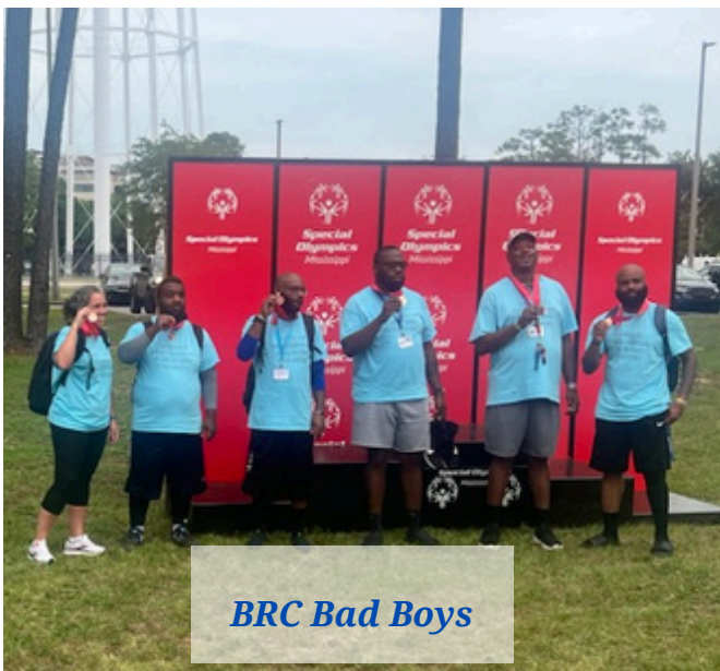
BRC Bad Boys