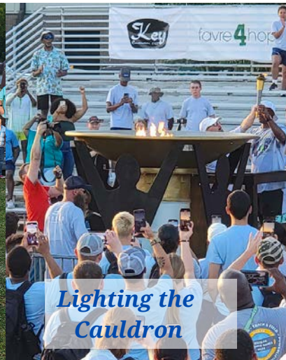
Lighting the Cauldron