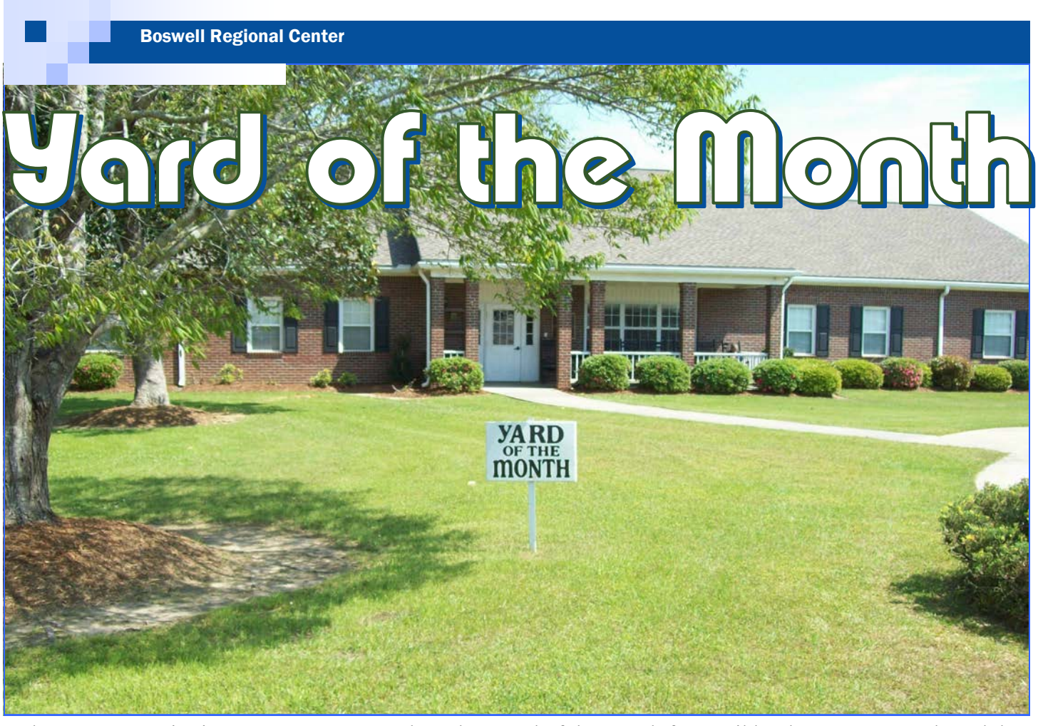
The Wesson Geriatric Group Home was selected as Yard of the month for April by the Wesson Garden Club.