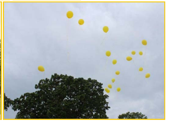
Staff and close friends of C. Osborne released yellow balloons in her memory. Yellow was her favorite color!