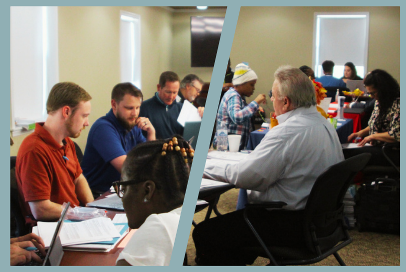
BRC recently hosted its annual open enrollment, allowing all employees an opportunity to review their current benefits/deductions and make changes where necessary.