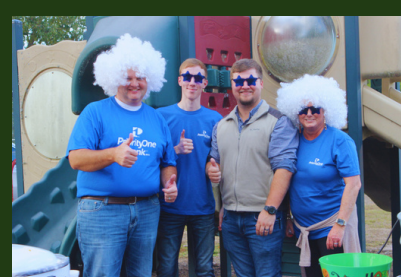
Priority One Bank