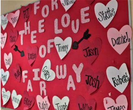
As usual, the bulletin boards and other areas were decorated with hearts and other festive Valentine's décor.