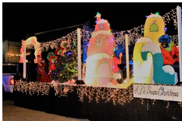
Boswell's individuals look forward to the Magee Christmas parade all year long. It's a festive event filled with law enforcement vehicles, horses and floats, including Boswell's own entry, above, depicting a "Dr. Seuss Christmas."