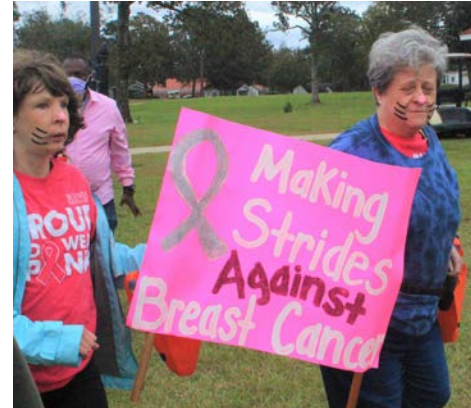
The ladies of Oakbrook, above, were excited to don their pink shirts (along with Halloween décor in preparation for that afternoon’s party) and walk to raise money during Breast Cancer Awareness Month.