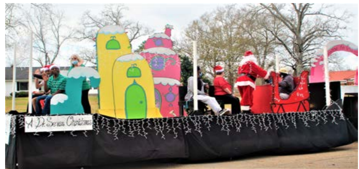
Boswell's Christmas was created by Maintenance and Community staff. Santa rode on the float and called out to individuals by name.