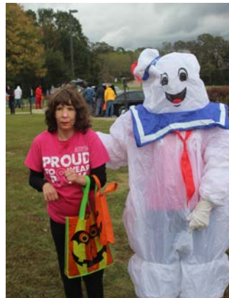
Trick-or-treating was enjoyed by individuals at Oakbrook and Ridgeview, complete with staff dressed as favorite characters.