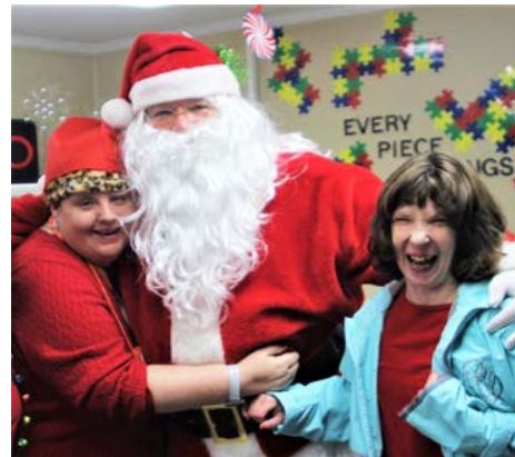
Dancing with Santa, above, and getting a hug, left, was the highlight of the night for these ladies at Oakbrook's party.