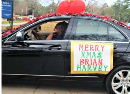
Family members decorated their vehicles and drove through campus to wave to their loved ones.

Reviving a popular event of the past, a Christmas parade through campus was held the week prior to Christmas. Staff, family members and City of Magee, including the Mayor, police and fire departments, participated this year to the delight of individuals.