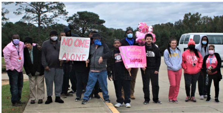
The guys at Fairway weren’t that excited about wearing pink, but walking was a different story. They enjoyed getting a little exercise and participating in an event to raise money to help others.