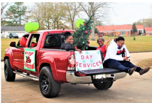
Day Services' staff enjoyed decorating a truck and riding in the parade together.