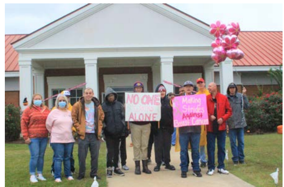
A brisk walk over to Green Park was the perfect outing for the energetic guys at Ridgeview, who are always good sports, willing to help for a good cause.