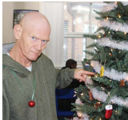
Individuals attending Day Services classes made Christmas ornaments in class and proudly showed off their work at a party, above left, while those attending art classes, left, presented their work while singing Christmas carols for staff.