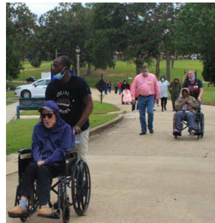
Despite their status as our elder individuals, the ladies and men of Pinelake, above, are always willing to get out and walk in honor of a good cause. It was a chilly day, but those that wanted to participate were bundled up and kept warm. Staff escorted those with mobility issues and made sure they walked or rode safely.