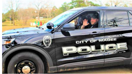
The City of Magee is always supportive of Boswell. Two police cars, a fire truck and Mayor Dale Berry, left, participated in the Christmas parade, something they've done since 2020.