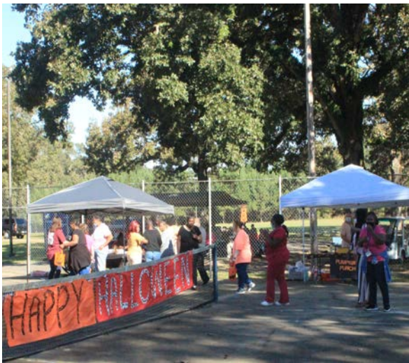
An outdoor fall festival was held in Green Park, complete with games, a dunking booth and refreshments.