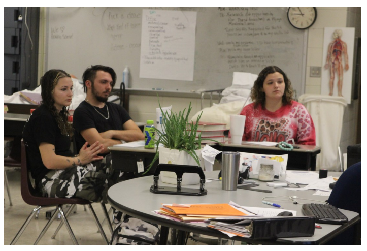
2nd year Health Science students listen as BRC staff members explain the benefits of working at BRC.