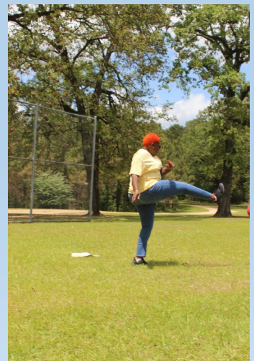
Staff and Individuals paired off into mixed teams, using the downtime to engage in some healthy competition over a game of Kick ball.